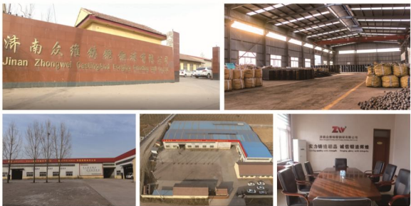
济南众维铸锻钢球有限公司 Jinan Zhongwei Casting And Forging Grinding Ball Co.,Ltd

公司通过ISO9001:2008质量管理体系认证,拥有先进的检测设备和完善的检测手段,确保产品的性能优良稳定。实力铸造精品 诚信锻造辉煌,公司将以“质量第一、诚信双赢”的发展理念,为国内外客户提供优质的产品和服务。